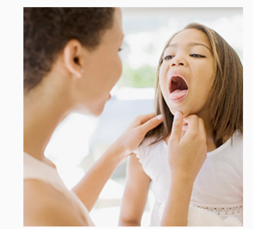
Strep Throat - Causes and Symptoms

Check out our website to learn more about these services or give us a call